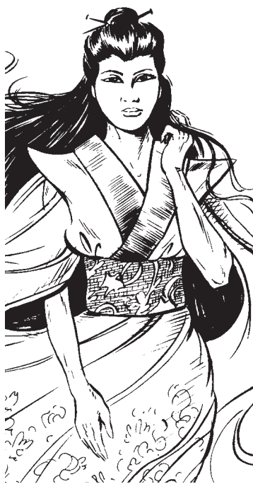
the ghost of the empress speaks